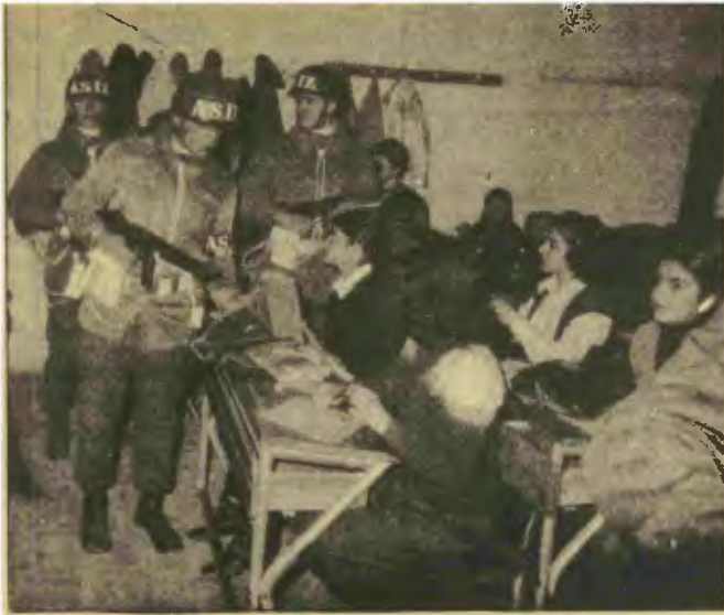
A primary school being searched by the army.