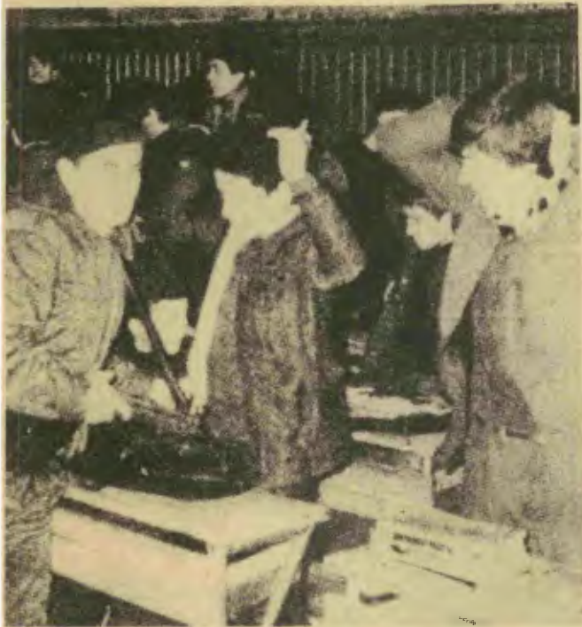
Armed with machine-guns, gendarmes and police searched classrooms, the library, gym and bedrooms at the Haydarpasa High School.