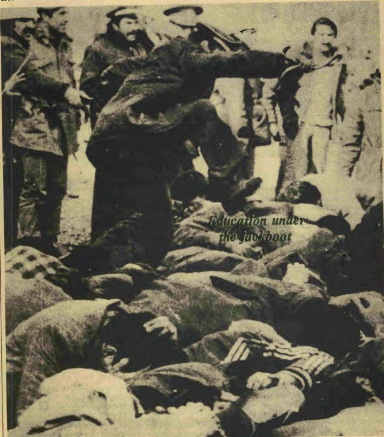
Education under the jackboot