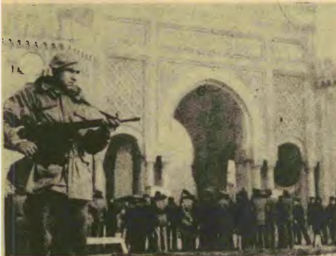
Army guard, again armed with a machine-gun, at Istanbul University.