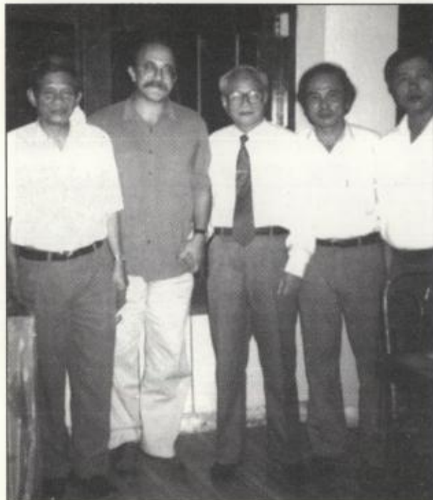
Com. Nguyen Duc Binh, Member of Polit Bureau, Secretary of the Central Committee of Communist Party of Vietnam

On the occasion of the 50th anniversary of the Communist Party of Vietnam we greet the people of Vietnam who together with Cuba proudly held the banner of socialism high after the collapse of the Soviet Union. This article is taken from the recording of a meeting between the Communist Party of Vietnam and the Communist Party of Turkey.